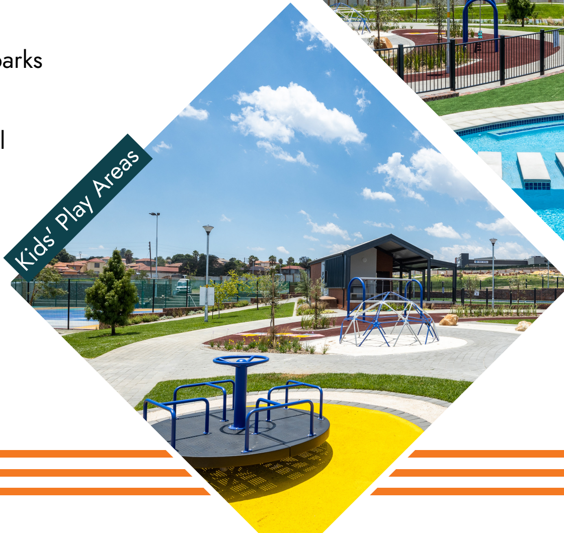
Kids' Play Areas