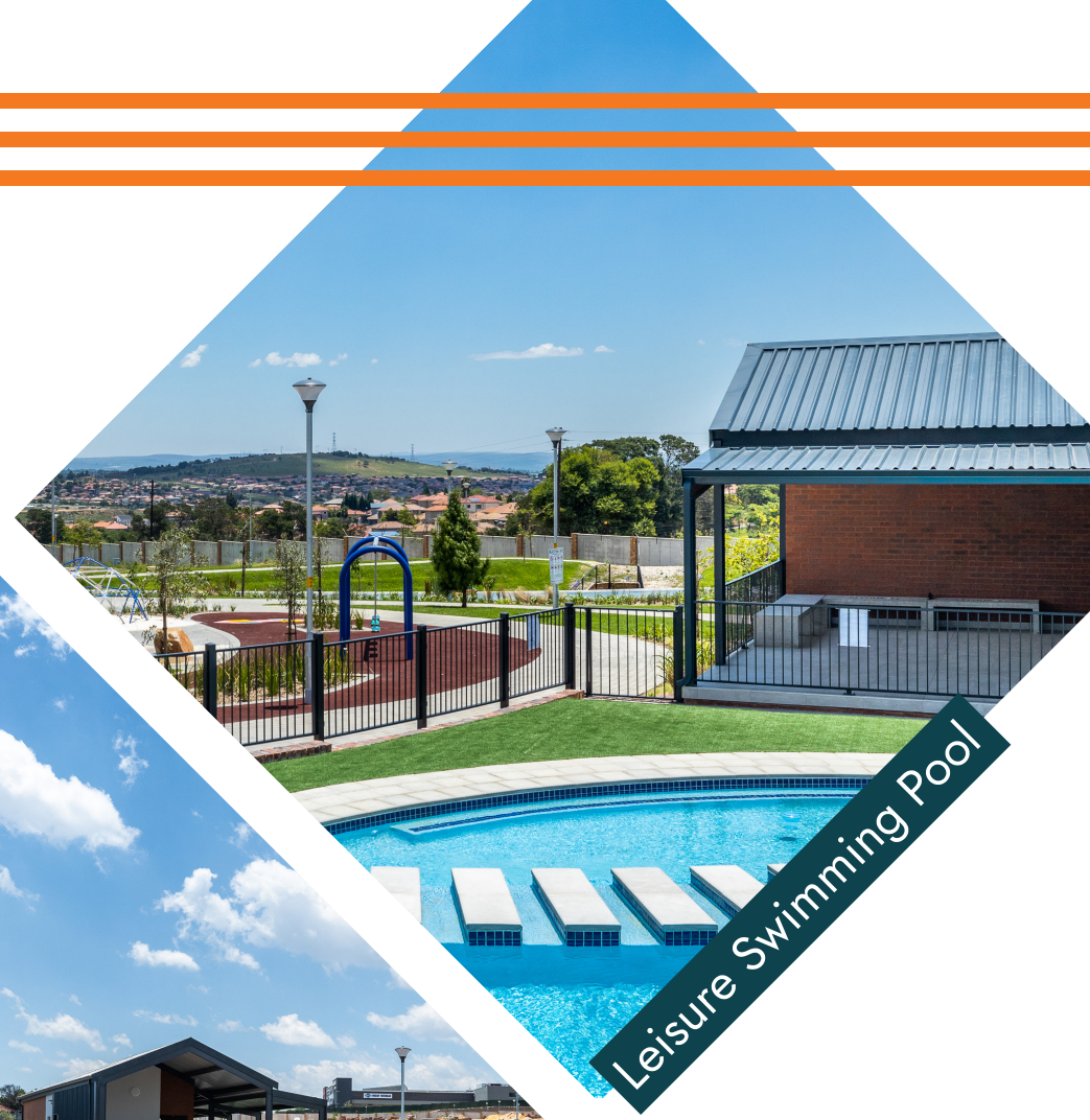
Leisure Swimming Pool